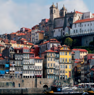
Porto e Norte