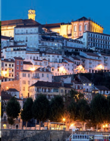
Centro de Portugal

Faça férias em Portugal. Consulte o seu Agente de Viagens.