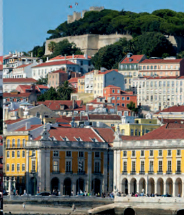
Lisboa e Vale do Tejo