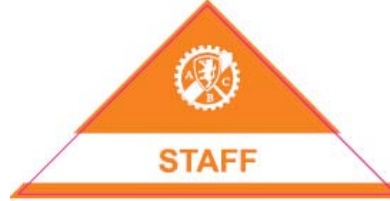
Car Plate "Staff"