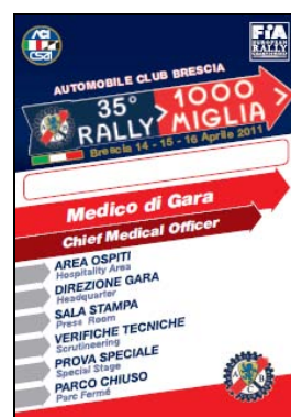
Chief Medical Officer