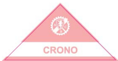
Car Plate "Time-keeper"