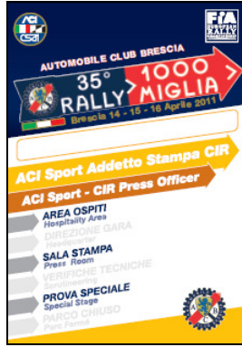
CIR Press Officer