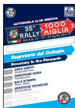
Secretary to the Stewards