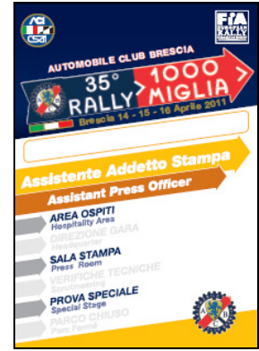
Press Off. Assistant