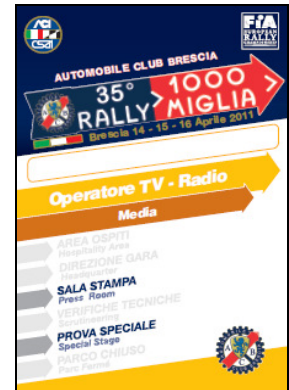
Media (TV / Radio)