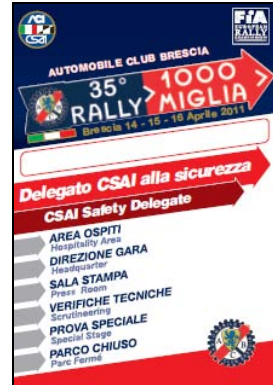
CSAI Safety Delegate