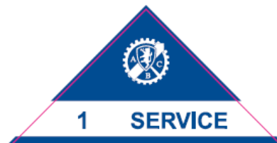
Car Plate "Service"