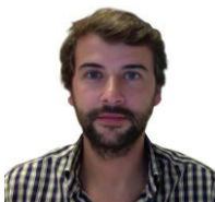
ANDRÉ ESTEVES spoken