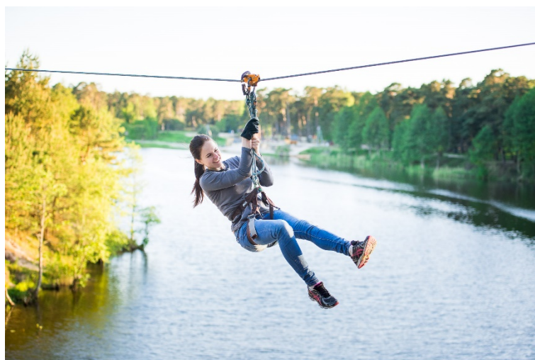
11-3 Adventure park Tarzāns

In Karosta, right next to the wakeboarding, boating and boarding centre and camping BB Wakepark , you will find the Tarzāns adventure park. The park contains five obstacle courses of varying difficulty, with a total of 77 obstacles, ranging from one to fifteen metres in height, for both children and adults, as well as a 330 metres long cable ride over the Beberliņi water reservoir, the longest such ride in Latvia.