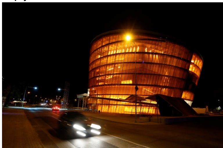
11-2 Concert hall Great Amber

Architecture and world class acoustics that spoil you – that is an apt description of the Liepāja concert hall Great Amber – providing exhibitions, concerts, and theatre performances for any taste. The oldest professional theatre in Latvia, Liepāja theatre, plays an important role in the culture of the city, with the theatre celebrating its one hundred and eleventh season this year. Classic and modern art can be viewed not only in the exhibition