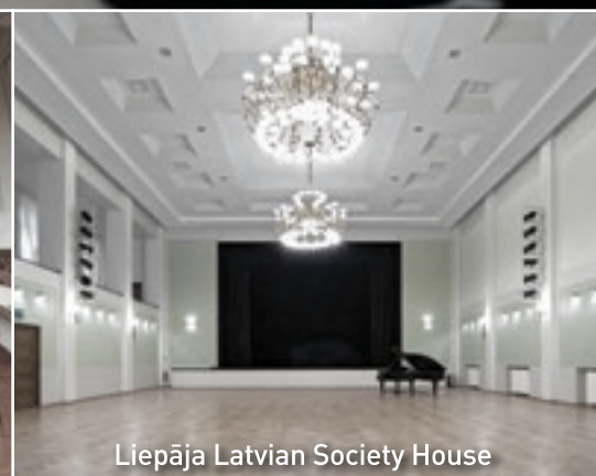
Liepāja Latvian Society House