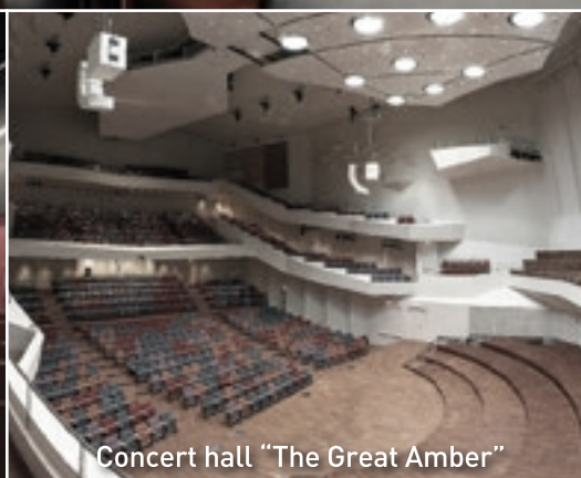
Concert hall "The Great Amber"