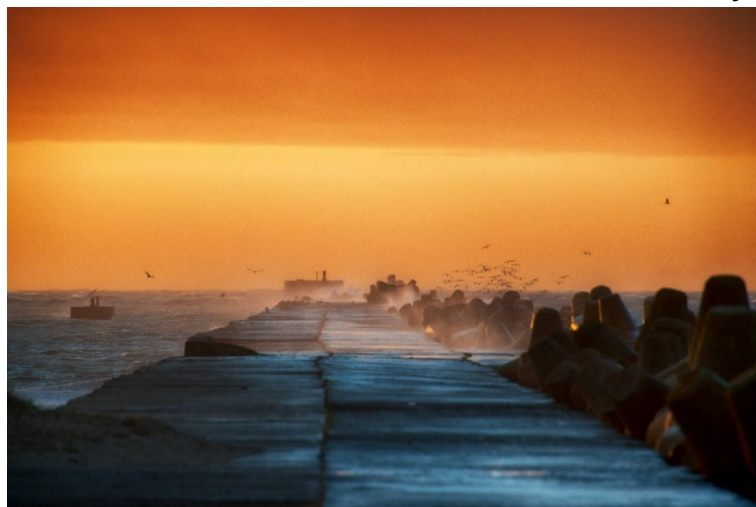
11-1 Liepāja port mole

Liepāja – a friendly environment. Liepāja is the most convenient city in the country for the modern citizen. It offers a healthy and active lifestyle, access to nature and the sea, a safe urban environment with effective infrastructure to complete any daily activity. The harmonic, smart, and versatile environment aids in creating strong personalities with influential ideas.