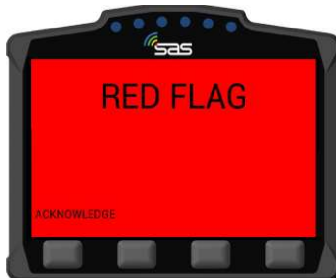
SCREEN 10. RED FLAG Acknowledge

SCREEN 10 – In the case of a serious incident, a stage may be red flagged from Race Control. The red flag will display a full screen warning until it is acknowledged. To acknowledge the flag the far left button must be pressed.