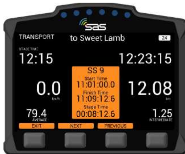
SCREEN 14. Times of completed stages

SCREEN 14 – By pressing the “VIEW TIMES” button, provisional transit and competitive stage times will display. You can select times for any of the completed stages with the next and previous buttons.