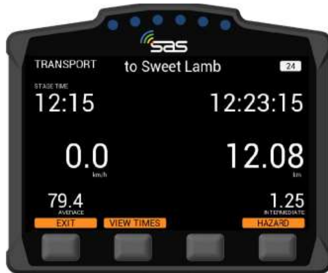
SCREEN 13. Transport Mode – View times/Send Hazard

SCREEN 13 – The option menu will allow the crew to view stage times “VIEW TIMES” or send a manual hazard/SOS “SEND HAZARD”.