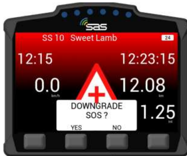
SCREEN 9A. Downgrade SOS

SCREEN 9A – If you select the cancel button on the SOS screen, you will be asked to confirm the downgrade. Once confirmed, the device will downgrade to an OK status.