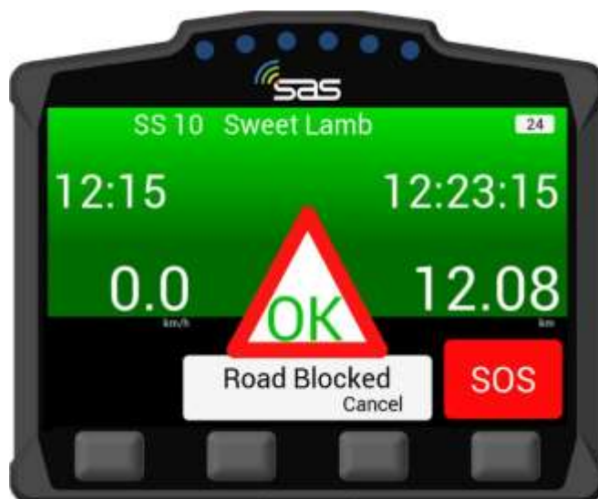
SCREEN 7A. OK – Road Blocked

SCREEN 7A – If you selected “Yes” to Road Blocked the following screen will appear, showing that you and the car are OK, but the competition road is BLOCKED. Race Control will be notified that the crew is OK but the course is obstructed.