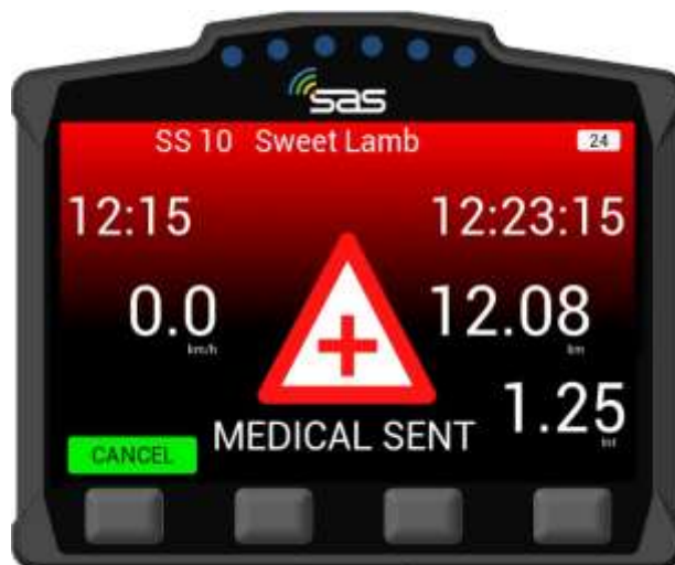
SCREEN 9. Downgrade SOS

SCREEN 9 – When the SOS is confirmed, the screen 9 will display. Even once confirmed, the hazard can be changed to OK. Pressing CANCEL and confirming the downgrade will inform race control that the crew are OK and do not need medical assistance.