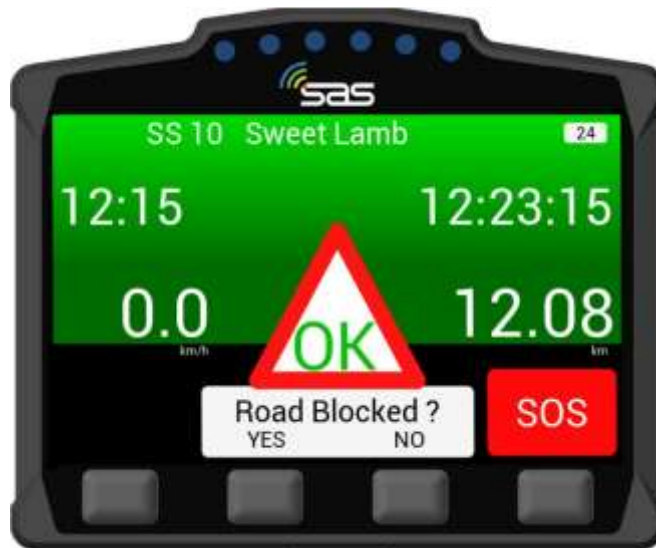
SCREEN 7. OK Acknowledgment

SCREEN 7 – If you select OK after the HAZARD alert, then the following screen will appear, showing that you and the car are OK. The Road Blocked prompt will appear below, select Yes if the vehicle is blocking the road, if the road is clear select NO.