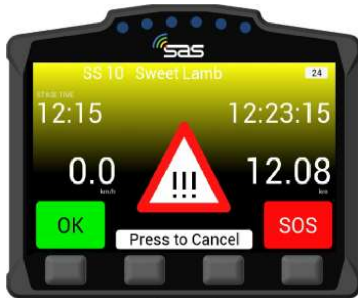
SCREEN 15. Manual Hazard in Transport Mode

SCREEN 15 – If manual hazard is sent in transport mode, this can be upgraded or downgraded the same way as a stage hazard. If the hazard is no longer required, it can also be cancelled by pressing either of the two middle buttons “PRESS TO CANCEL”.