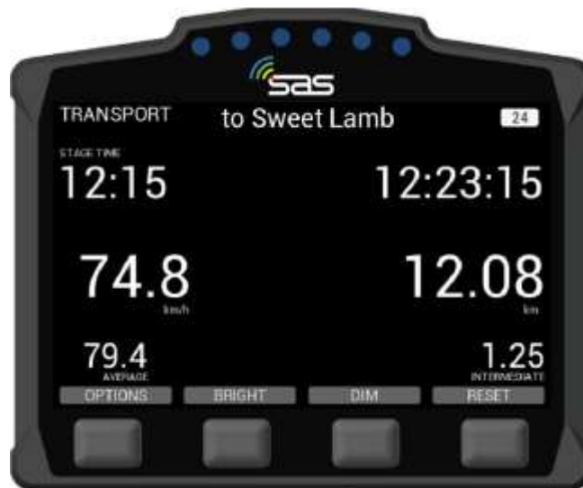
SCREEN 12. Transport Mode

SCREEN 12 – In transport mode, the unit has a menu that can be accessed by pressing the options button.