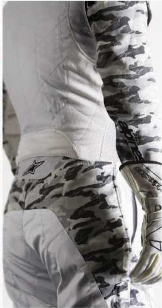
GP Tech suit